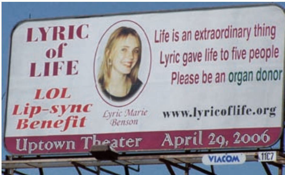
Lyric's beat goes on through a powerful billboard message